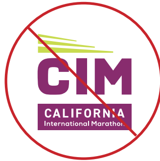
CHANGE THE COLORS