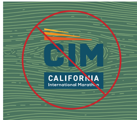
PLACE ON BUSY OR UNREADABLE BACKGROUND