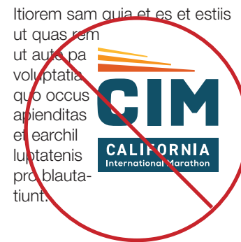
CROWD THE CLEAR SPACE